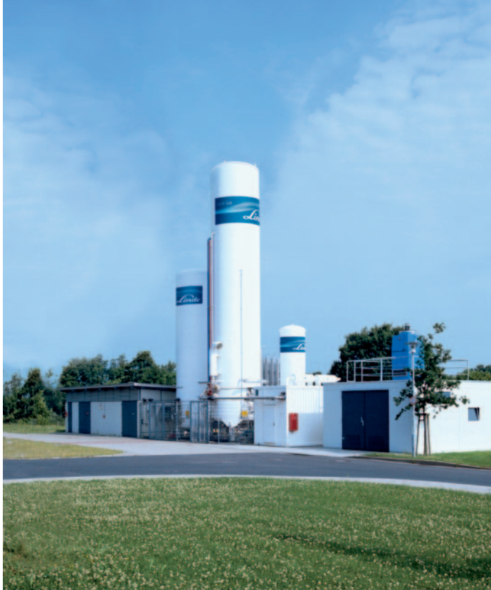
On-site supply with the ECOVAR® system.