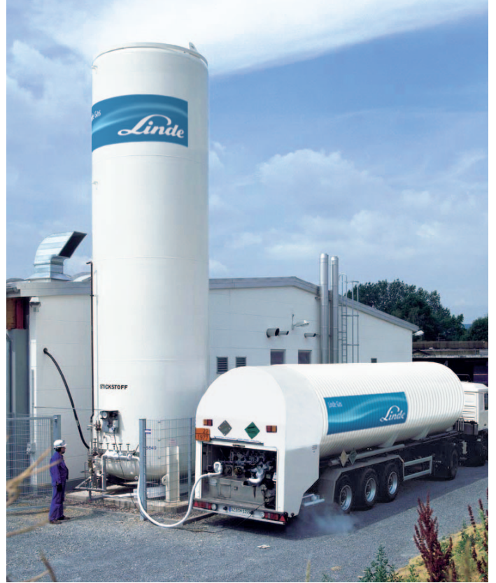
Bulk delivery of liquid nitrogen.