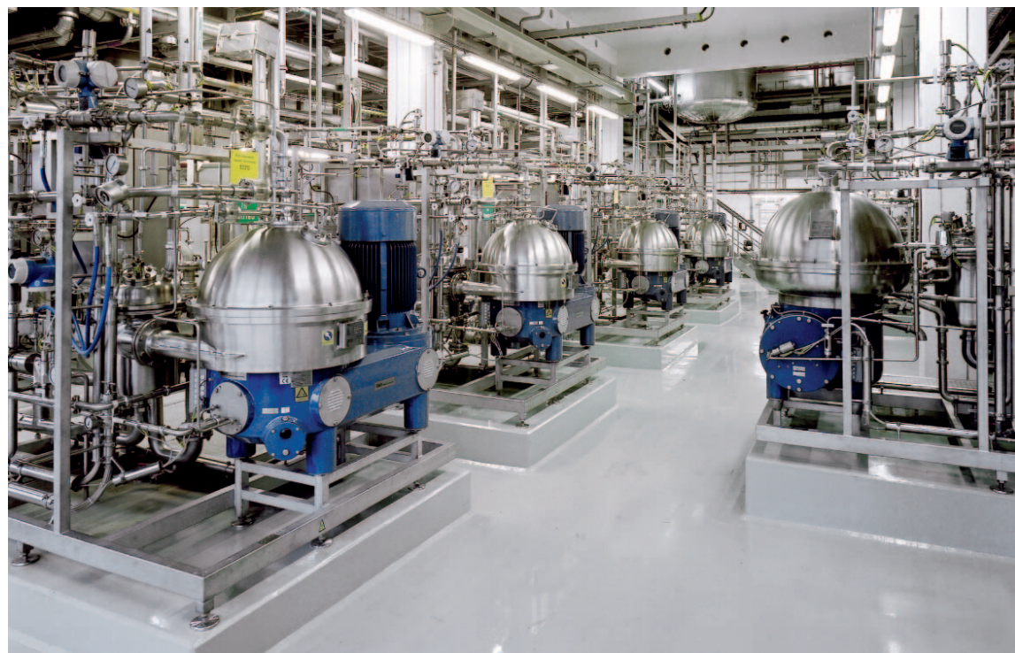
A view into a large-scale biopharmaceutical plant, designed and constructed by Linde-KCA-Dresden.

Linde-KCA-Dresden GmbH Bodenbacher Strasse 80, 01277 Dresden, Germany Phone +49.351.250-30, Fax +49.351.250-48 00, www.linde-kca.com