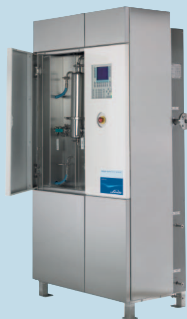
With VERISEQ® SLG150, sterile liquid nitrogen is easily obtained.

Gas is normally sterilized with a filter at the point of use, but sometimes sterile liquid gas is required. Liquid nitrogen might be thought sterile in itself due to its low temperature. However, it is even used to preserve living microorganisms. No conventional sterile filter can withstand cryogenic temperatures for very long. Linde Gas circumvents this by liquefying sterile filtered gas in its VERISEQ® Sterile Liquid Gas (SLG) system. The VERISEQ® SLG system belongs to the VERISEQ® PGC (Pharmaceutical Gas Concept). It has been designed for use in pharmaceutical production.