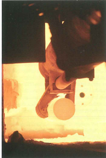
A rotary hearth furnace at ArcelorMittal Shelby operating with 100% flameless oxyfuel

We will continue building on the platform established