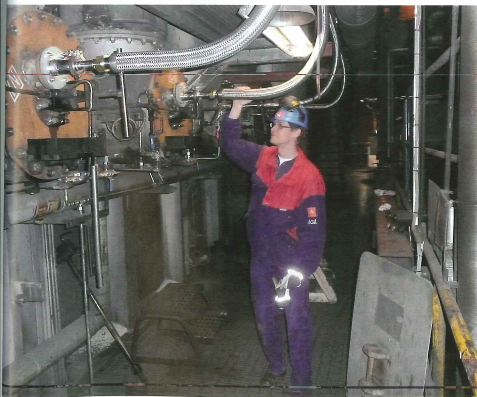
The REBOX HLL installation in a 300 t/h walking beam furnace at SSAB, Borlänge.

The successful results from REBOX industrial installations of flameless oxyfuel in 30 furnaces demonstrate clear advantages over other alternatives. Further optimization of the installation in the walking beam furnace at SSAB in Borlänge, Sweden grants additional benefits as to those already achieved. Production flexibility, capacity increase, energy efficiency and higher production limits with fewer furnaces are all achievable based on the mill demand. ■